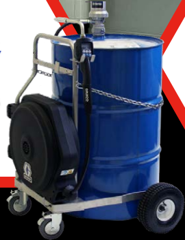
Fire-Ball™ 300 Pump

PULSE fluid management simplifies how forward-thinking service shops track and manage bulk fluids in real time- adding more transparency and accountability to drive productivity and profitability.