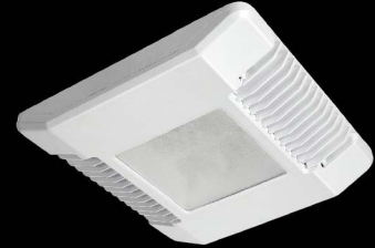
The CPY250™ Canopy

EnviroLube is a quicklube/vehicle service system comprised of manufactured fiberglass modules specifically designed for drive-through service in auto dealerships, quicklubes and heavy-duty facilities.