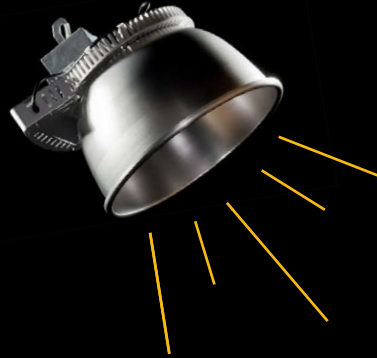
The CREE CXB Series