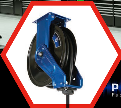
Pulse Meter & XD Hose Reel