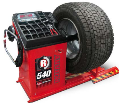
R540 RLTD Truck 2D Wheel Balancer