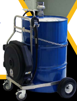
Pulse Meter & XD Hose Reel