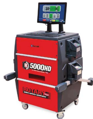
R5000HD Commercial Truck Alignment System

Rotary offers dependable, quality-made wheel service equipment, including wheel balancers, tire changers and vehicle alignment equipment.