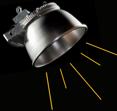
The CREE CXB Series