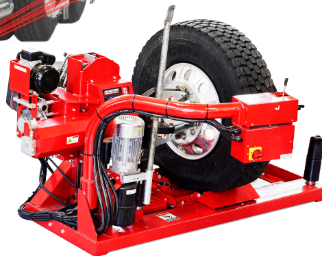
TCX625HD Heavy-Duty Tire Changer