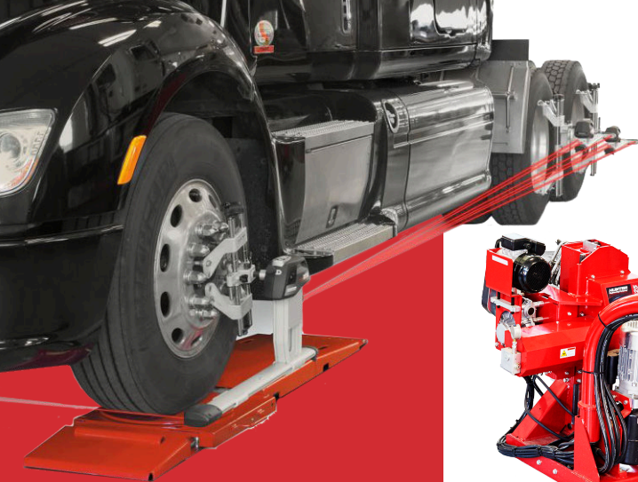
WinAlign® HD Alignment Systems