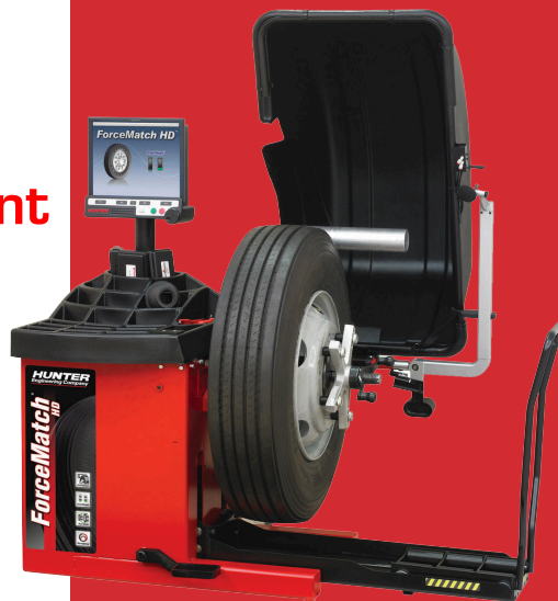
ForceMatch® HD Balancer

Over 350 patented inventions from the largest wheel service product in the world.