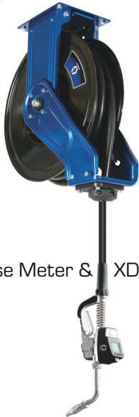
Pulse Meter & XD Hose Reel