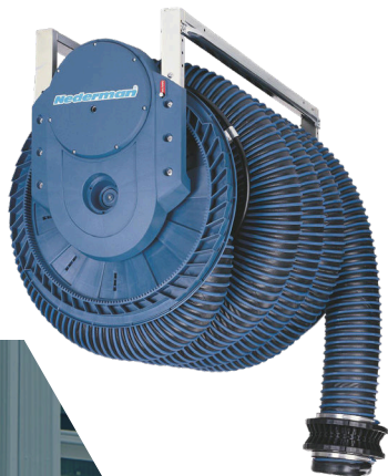
Spring Recoiled Exhaust Hose Reel

Vehicle exhaust and welding fumes, dust from sanding and grinding as well as oil spillage are just some of the hazards in vehicle workshops. Nederman helps you all the way from designing and planning to installation, service and maintenance.