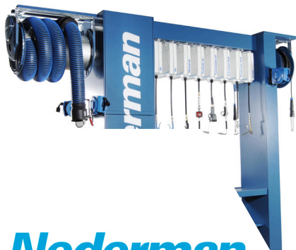
Service Tower HD