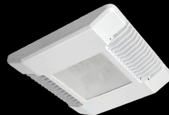
The CPY250™ Canopy

EnviroLube is a quicklube/vehicle service system comprised of manufactured fiberglass modules specifically designed for drive-through service in auto dealerships, quicklubes and heavy-duty facilities.