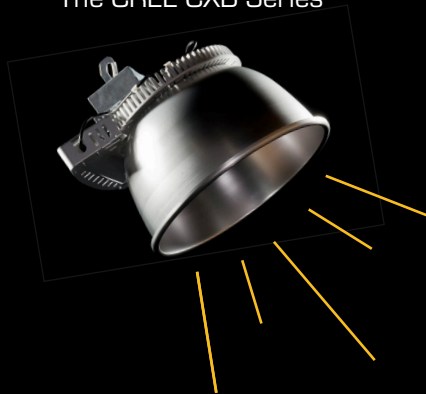
The CREE CXB Series