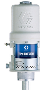
Fire-Ball™ 300 Pump

PULSE fluid management simplifies how forward-thinking service shops track and manage bulk fluids in real time- adding more transparency and accountability to drive productivity and profitability.