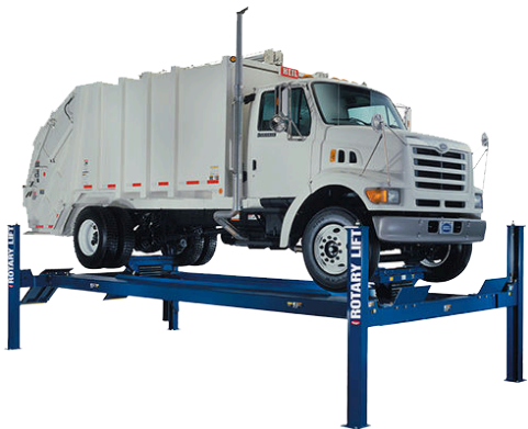
Heavy Duty Four Post Lifts